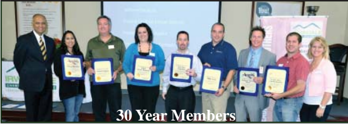
30 Year Members