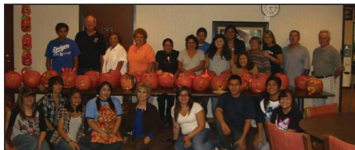
Teen Club and Seniors showing off their pumpkin carving skills.